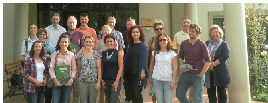
The project participants visiting one of the cases.