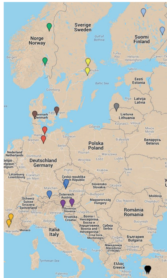
Figure 1: Localisation of the cases studied